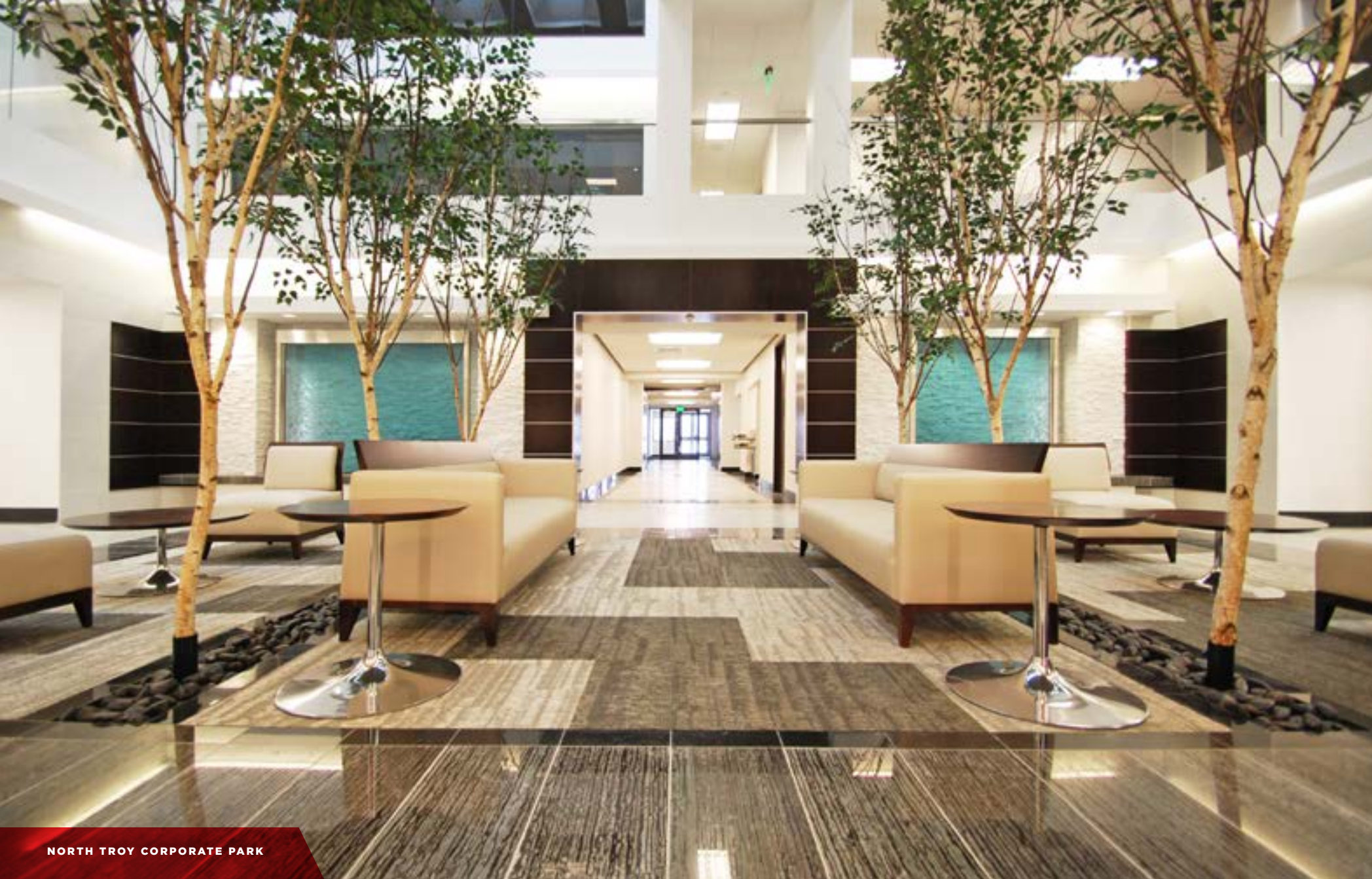
NORTH TROY CORPORATE PARK